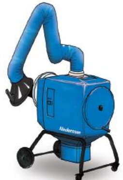
FilterBox 12 M A cost efficient unit, manually cleaned, with high performance fan for heavier applications

CALL NORTON SANDBLASTING EQUIPMENT TODAY FOR YOUR WELDING SOLUTION NEEDS 757 548-4842 or Toll Free 800 366-4341