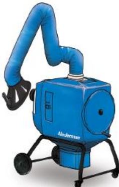
FilterBox 10 M A cost efficient unit, manually cleaned for light to medium dust & fume applications