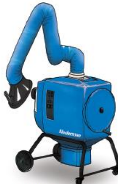
FilterBox 10 A Automatically cleaned for light to medium dust & fume applications