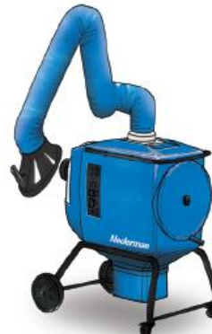
FilterBox 10 eQ Top of the line, ergonomic unit for light to medium dust & fume applications