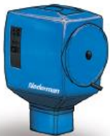
FilterBox Wall A versatile unit without extraction arm for connection to external fan